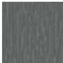
8773V Livid Grey (LRV - Y10.40)