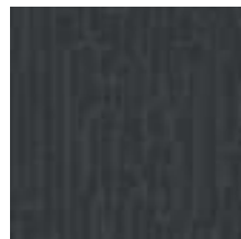
8775V Ghost Machine (LRV - Y4.19)