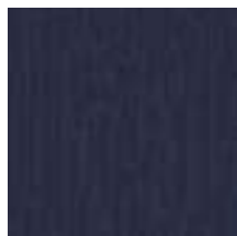
6755V Electric Azure (LRV - Y3.77)