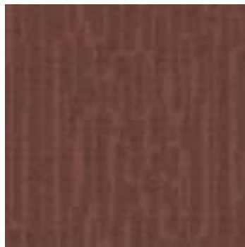
3730V Moccasin (LRV - Y10.37)