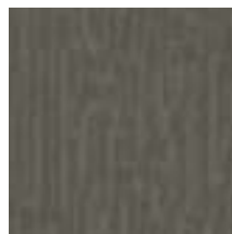
1763V Crackled Station (LRV - Y12.20)