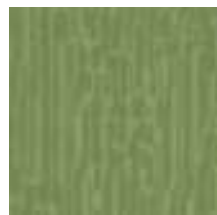
5761V Lime Spring (LRV - Y24.37)