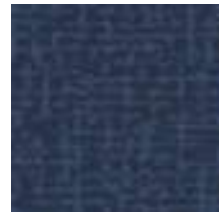
6755N Glam Cyan (LRV - Y3.60)