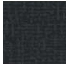
9778N Castle Black (LRV - Y1.91)