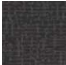
9749N Bear Silver (LRV - Y4.15)