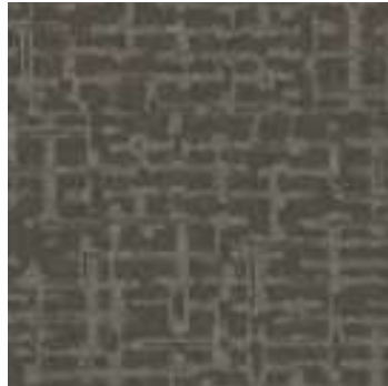
1746N Lucent Grey (LRV - Y7.63)