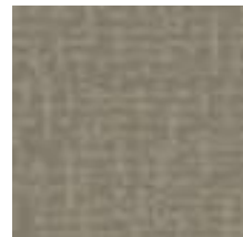
1790N Polar Trek (LRV - Y18.94)