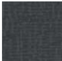
8779N Silver Wolf (LRV - Y3.94)